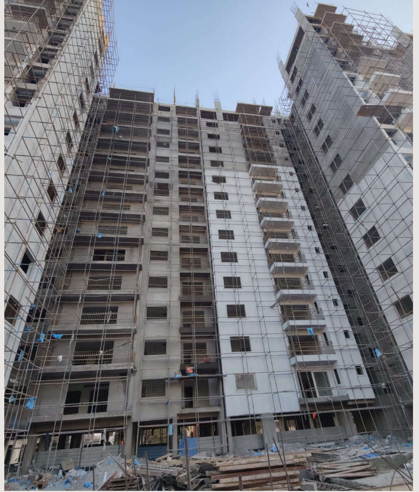
Back side view