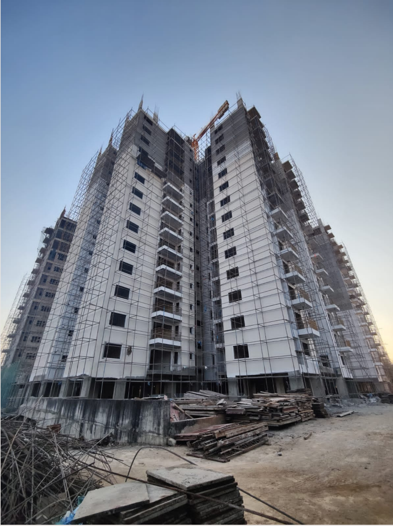
Back side view