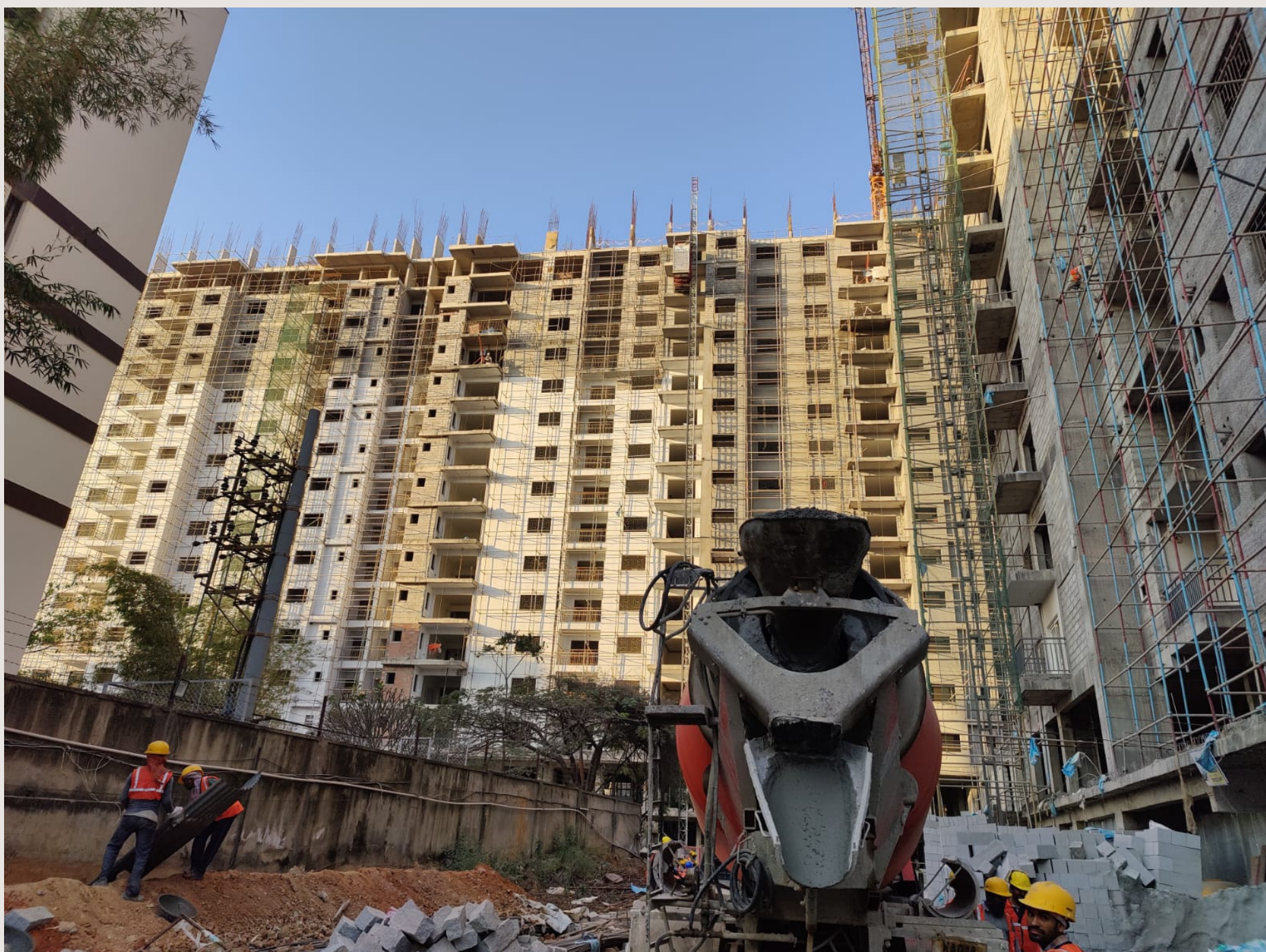
Front side view