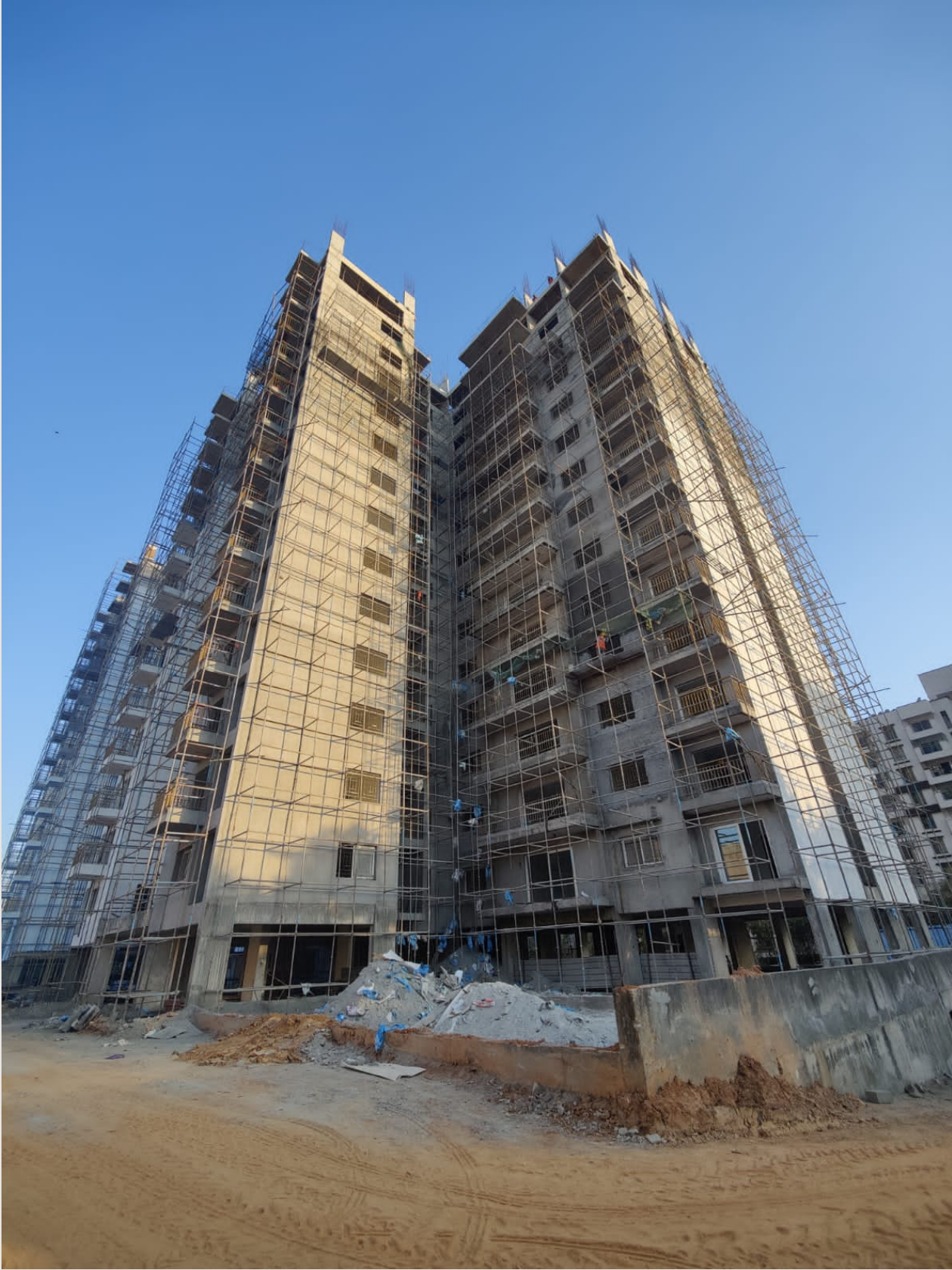
Back side view